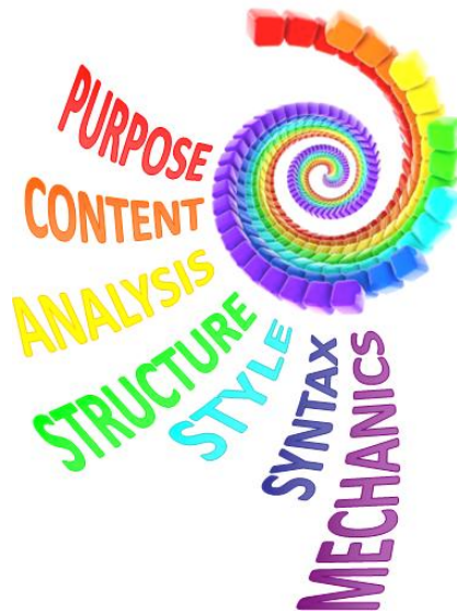
Figure 3. The IRWC Logo

of content (Criterion 2). Secondly, the ascending and expanding spiral symbolises an evolving and expanding capacity for literacy across increasingly diverse and changing contexts. An increasingly literate person develops their capacity to write and read effectively in a range of genres appropriate to different contexts. For example, an effective writer understands the conventions for writing an analytical essay or a personal reflection and the purposes and contexts that are most appropriate for these genres.