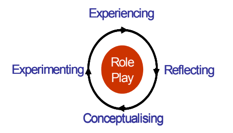
Figure 4: Our use of Kolb's (1984) pedagogical cycle

To support student learning COPS integrates Kolb's pedagogical cycle with the problem workflow (Figure 4) using role play. This cycle is consistent with a constructivist approach and involves students experimenting, experiencing, forming assumptions, testing, and creating meaning from experience. At any time during the life of the 'problem', rudimentary elements which support students in each of the steps in Figure 4 can be created and therefore seen displayed in the student interface (Figure 5), for example, the top tabs showing investigate, reflect, act, and side links to the journal, reflection and collaborative areas. The collaborative area provides opportunities for interaction. If the teacher chooses to design the problem so that collaboration must occur before a decision can be reached, then it is possible to ensure that students are encouraged to interact with their team mates throughout the problem, thereby helping to reduce the likelihood of isolation during the learning process (Herrington, Oliver, & Reeves, 2003).