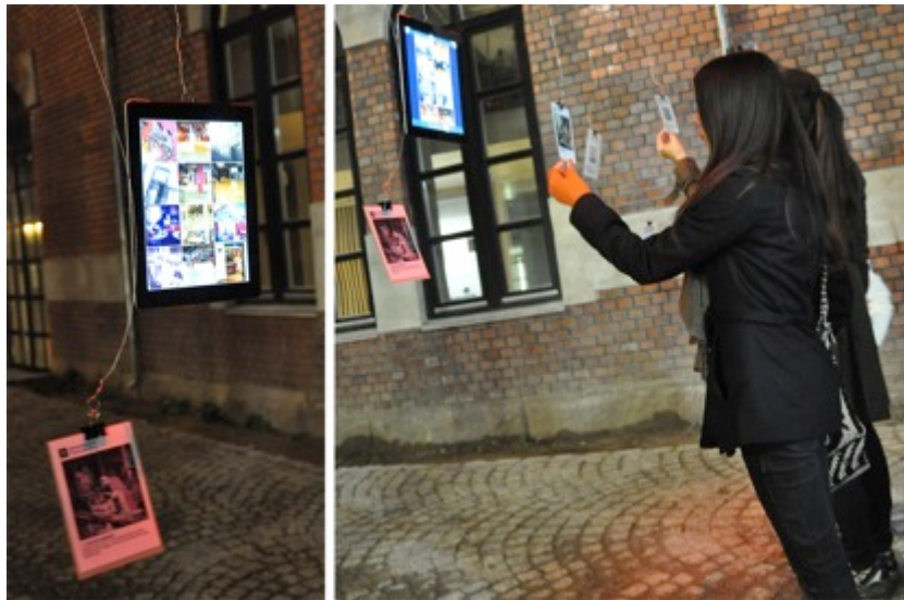
Figure 3. One of the three installation sites. iPads were available for viewing the photo stream in real-time (left), with cards containing text prompts to encourage interactions by way of the QR codes.

Printouts were made of the @akerselvadigital stream photos, scaled 200%, and marked with a QR code. These printouts were then laminated for durability and strung at the specific site relevant to each theme. The QR-codes on the laminated printouts linked users directly to the Instagram stream, making an onsite connection between the physical site where the event occurred and the digital space being curated on Instagram. Accompanying text and questions were intended as trigger points for reflection over contradictions between the past and now. In inviting river walkers to access by way of QR-codes, we hoped to provide an incentive to participate by adding their own photos or comments stimulated by the prompting texts.