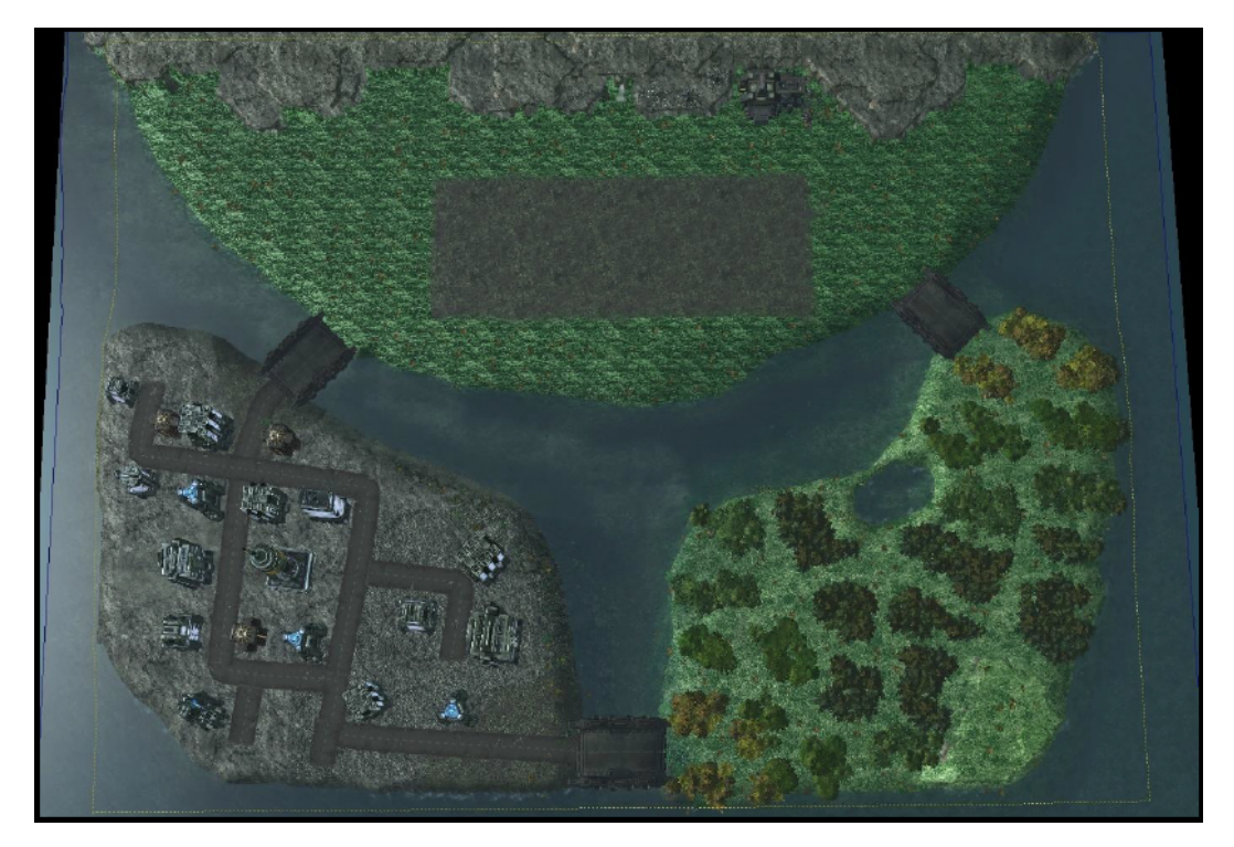
Figure 2: Starvest, an example level created by students using the StarCraft II editor